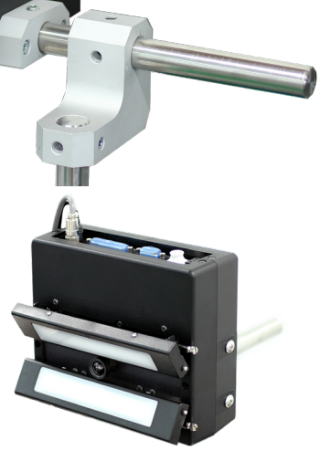
▲Camera; Lights; Controller

The synchronization function connects the system to an inkjet printer. This function helps to reduce not only the input workload but also input errors.